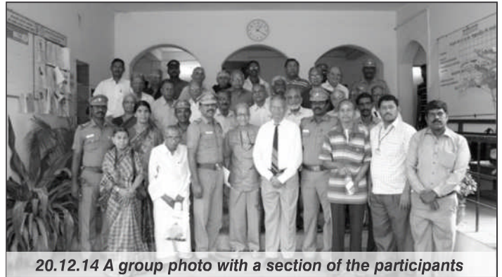
20.12.14 A group photo with a section of the participants