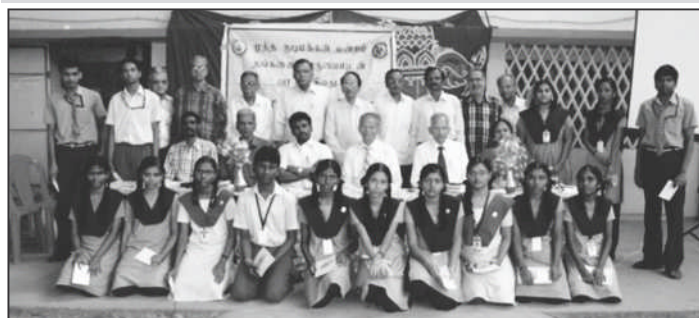
A view of the group photo with student awardees(first row), Dignitaries (2nd row) and EC members with student awardees.