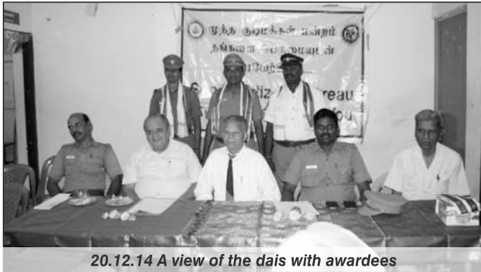
20.12.14 A view of the dais with awardees